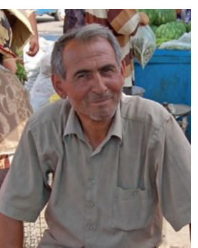
Population: 1,100 World Popl: 9,239,000 Total Countries: 20

People Cluster: Azerbaijani Main Language: Azerbaijani, North