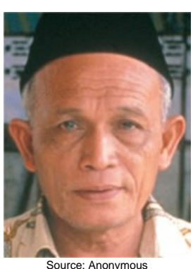
Population: 26,000 World Popl: 26,000