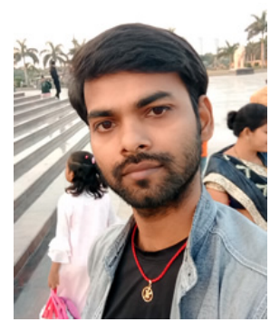
Population: 19,625,000 World Popl: 19,830,000