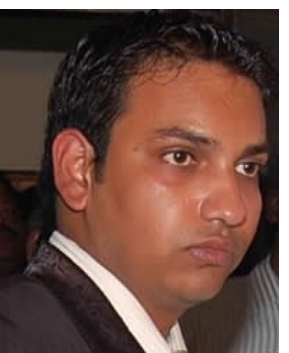
Total Countries: 4 People Cluster: South Asia Forward Caste