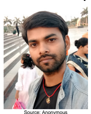
Population: 19,000 World Popl: 19,830,000