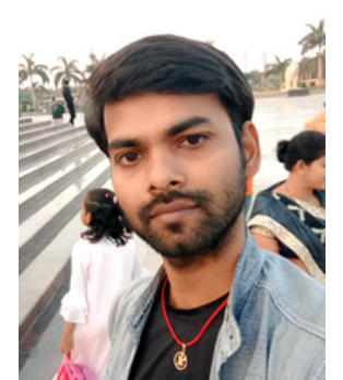
Population: 4,000 World Popl: 19,830,000