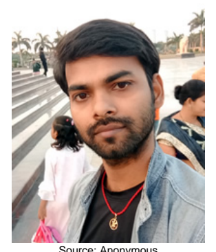
Population: 140,000 World Popl: 19,830,000