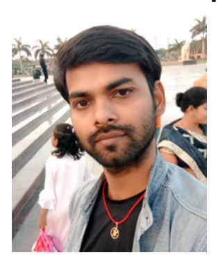
Population: 11,000 World Popl: 19,830,000