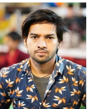
Population: 3,200 World Popl: 24,341,800 Total Countries: 31 People Cluster: Thai Main Language: Thai Main Religion: Buddhism Status: <a>Onreached</a> Evangelicals: 0.90% Chr Adherents: 1.50%