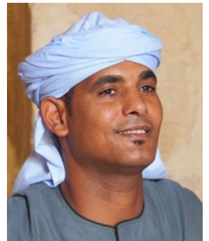
Population: 881,000 World Popl: 7,595,400 Total Countries: 12

People Cluster: Arab, Arabian Main Language: Arabic, Gulf Main Religion: Islam