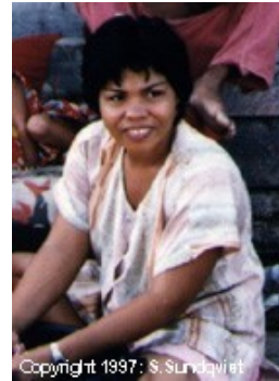
Copyright 1997: S. Surigawati Source: Bethany World Prayer Center

Population: 5,700 World Popl: 112,700 Total Countries: 2 People Cluster: Filipino, Muslim Main Language: Sama, Balangingih Main Religion: Islam Status: ★ Frontier Unreached Evangelicals: 0.00% Chr Adherents: 0.00% Scripture: New Testament