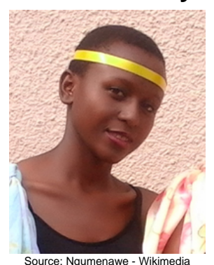
Population: 15,000 World Popl: 5,000,000