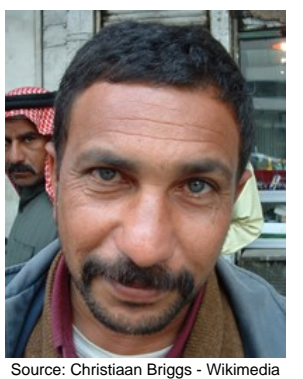
Population: 2,200 World Popl: 22,460,800 Total Countries: 25 People Cluster: Arab, Levant