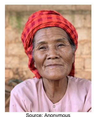
Population: 110,000 World Popl: 31,102,100 Total Countries: 20 People Cluster: Burmese Main Language: Burmese Main Religion: Buddhism Status: Unreached

Evangelicals: 0.08% Chr Adherents: 0.30%