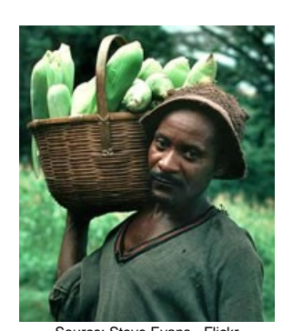
Population: 60,000 World Popl: 1,434,000