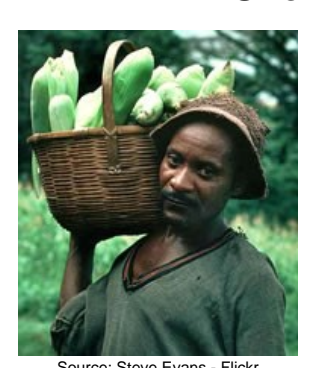
Population: 12,000 World Popl: 1,434,000