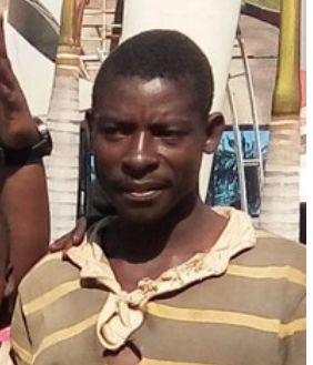
Main Language: Shona Main Religion: Ethnic Religions