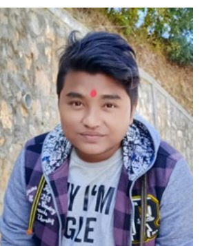
Population: 39,000 World Popl: 532,000