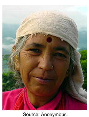
Population: 32,000 World Popl: 468,600