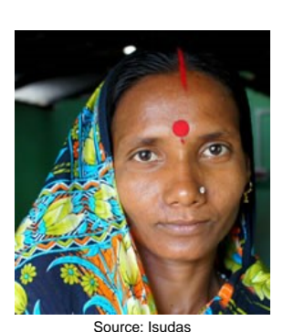
Population: 1,341,000 World Popl: 1,417,000