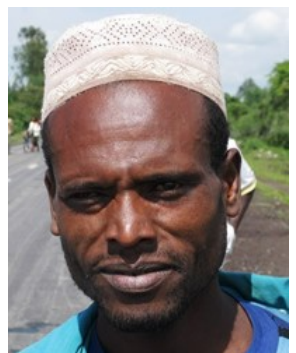
Population: 448,000 World Popl: 448,000 Total Countries: 1