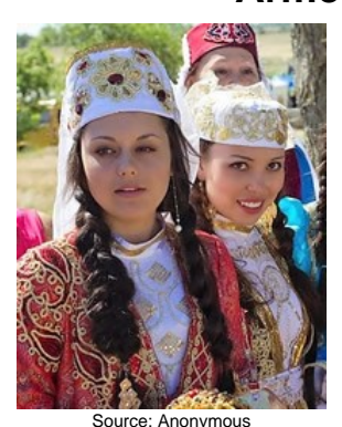
Population: 34,000 World Popl: 6,055,200 Total Countries: 54 People Cluster: Armenian