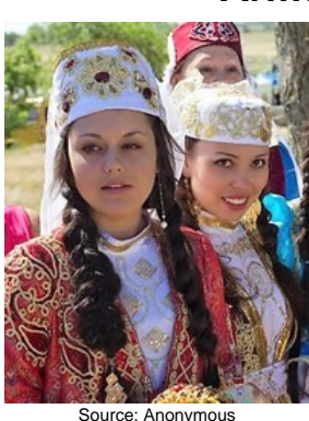
Population: 34,000 World Popl: 6,055,200 Total Countries: 54 People Cluster: Armenian