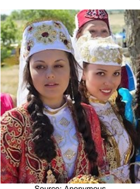
Population: 34,000 World Popl: 6,055,200 Total Countries: 54