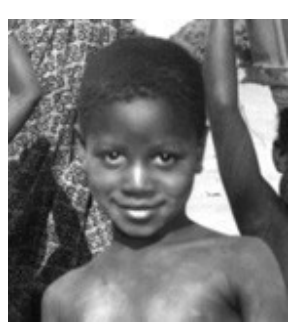
Bethany World Prayer Center

Population: 29,000 World Popl: 29,000 Total Countries: 1 People Cluster: Benue Main Language: C'lela