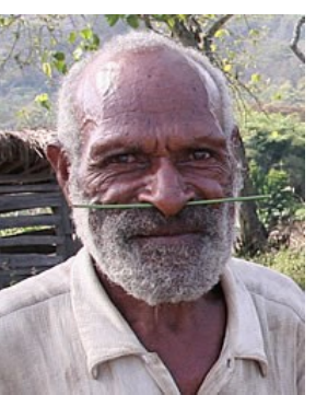
World Popl: 111,000 Total Countries: 1

People Cluster: New Guinea Main Language: Benabena Main Religion: Christianity