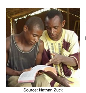
Population: 24,000 World Popl: 72,000 Total Countries: 2 People Cluster: Pygmy

Main Language: Yaka (Central African Rep