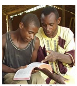
Population: 24,000 World Popl: 72,000 Total Countries: 2 People Cluster: Pygmy

Main Language: Yaka (Central African Rep Main Religion: Ethnic Religions