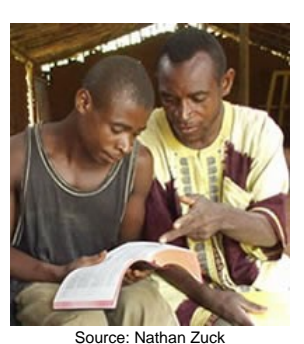
World Popl: 72,000 Total Countries: 2 People Cluster: Pygmy