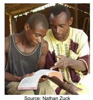
Total Countries: 2 People Cluster: Pygmy

Main Language: Yaka (Central African Rep