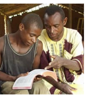
Total Countries: 2

People Cluster: Pygmy Main Language: Yaka (Central African Rep