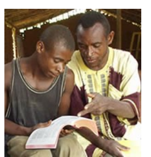
World Popl: 72,000 Total Countries: 2 People Cluster: Pygmy