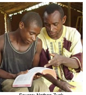
Population: 24,000 World Popl: 72,000 Total Countries: 2 People Cluster: Pygmy

Main Language: Yaka (Central African Rep Main Religion: Ethnic Religions