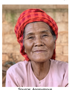
Population: 5,400 World Popl: 31,102,100 Total Countries: 20 People Cluster: Burmese

Main Language: Burmese Main Religion: Buddhism