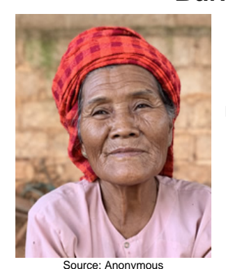
Population: 5,400 World Popl: 31,102,100 Total Countries: 20 People Cluster: Burmese Main Language: Burmese Main Religion: Buddhism