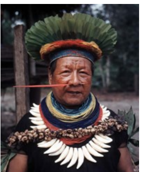
Population: 1,900 World Popl: 3,400 Total Countries: 2

People Cluster: South American Indigenous