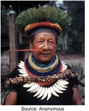
World Popl: 3,400 Total Countries: 2