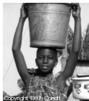
Copyright 1987: Condit Source: Bethany World Prayer Center

Population: 22,000 World Popl: 22,000 Total Countries: 1 People Cluster: Benue Main Language: Ejuele Main Religion: Ethnic Religions Status: ● Partially reached Evangelicals: 3.0% Chr Adherents: 10.0% Scripture: Translation Started