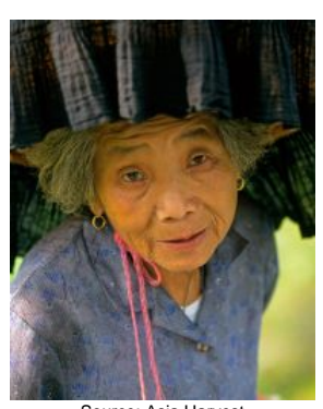
Population: 9,400 World Popl: 43,930,100

Total Countries: 23 People Cluster: Chinese Main Language: Chinese, Hakka