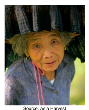
Population: 9,400 World Popl: 43,930,100

Total Countries: 23 People Cluster: Chinese Main Language: Chinese, Hakka