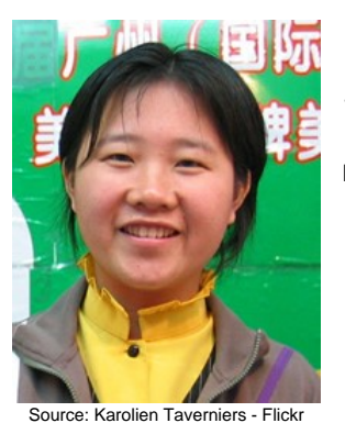
Population: 1,500 World Popl: 79,428,700 Total Countries: 36 People Cluster: Chinese Main Language: Chinese, Yue Main Religion: Non-Religious Status: Partially reached