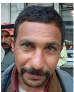
Population: 2,900 World Popl: 22,460,800 Total Countries: 25