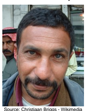
Population: 133,000 World Popl: 22,460,800