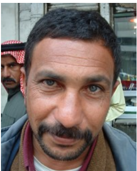
Population: 133,000 World Popl: 22,460,800 Total Countries: 25