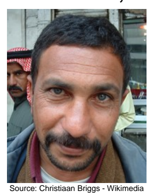
Population: 133,000 World Popl: 22,460,800