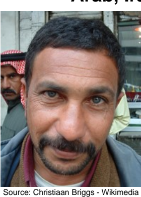
Population: 133,000 World Popl: 22,460,800