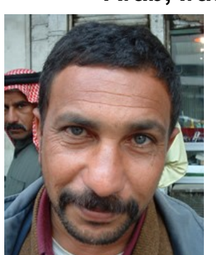
Population: 133,000 World Popl: 22,460,800 Total Countries: 25