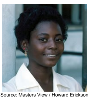
World Popl: 3,374,800 Total Countries: 14 People Cluster: Afro-American, Northern