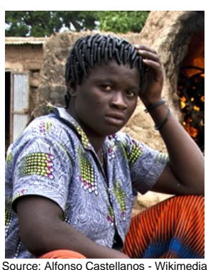
Population: 356,000 World Popl: 785,000 Total Countries: 3 People Cluster: Gur Main Language: Lobi

Main Religion: Ethnic Religions Status: • Unreached Evangelicals: 1.50%