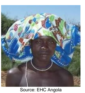
Population: 267,000 World Popl: 1,042,000 Total Countries: 3