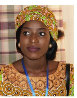
Population: 1,072,000 World Popl: 1,081,500

Total Countries: 2 People Cluster: Chadic Main Language: Mafa Main Religion: Islam