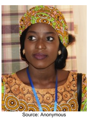
Population: 1,072,000 World Popl: 1,081,500 Total Countries: 2 People Cluster: Chadic Main Language: Mafa