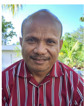
Population: 146,000 World Popl: 146,000 Total Countries: 1 People Cluster: Timor Main Language: Makasae Main Religion: Christianity