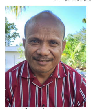
Population: 146,000 World Popl: 146,000 Total Countries: 1 People Cluster: Timor Main Language: Makasae Main Religion: Christianity