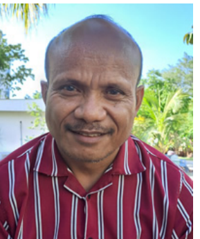
World Popl: 146,000 Total Countries: 1 People Cluster: Timor Main Language: Makasae Main Religion: Christianity Status: Partially reached