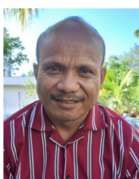
Population: 146,000 World Popl: 146,000 Total Countries: 1 People Cluster: Timor Main Language: Makasae Main Religion: Christianity