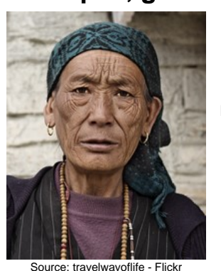
Population: 16,000 World Popl: 1,209,700 Total Countries: 13

People Cluster: South Asia Hindu - other