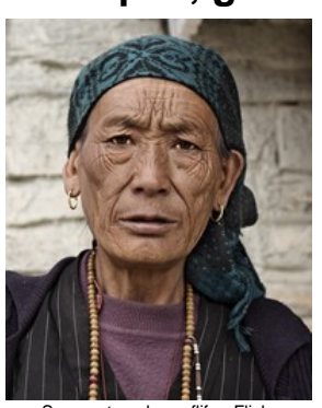
Population: 16,000 World Popl: 1,209,700 Total Countries: 13

People Cluster: South Asia Hindu - other