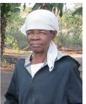
Population: 2,119,000 World Popl: 2,851,100