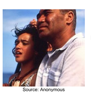
Population: 13,000 World Popl: 674,700 Total Countries: 3

People Cluster: Polynesian Main Language: Maori Main Religion: Christianity