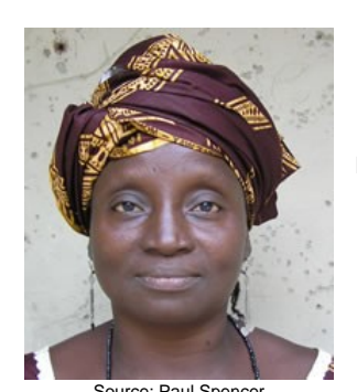
Population: 13,000 World Popl: 26,000 Total Countries: 2 People Cluster: Atlantic Main Language: Nalu Main Religion: Islam