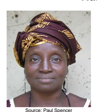
Population: 13,000 World Popl: 26,000 Total Countries: 2 People Cluster: Atlantic Main Language: Nalu Main Religion: Islam