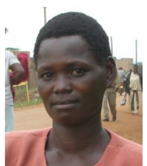
Population: 1,469,000 World Popl: 1,469,000