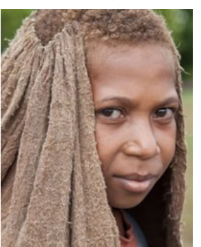
Population: 9,000 World Popl: 9,000 Total Countries: 1

People Cluster: New Guinea Main Language: Simbari Main Religion: Christianity