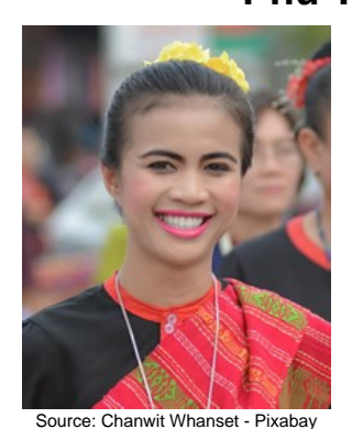
Population: 261,000 World Popl: 1,064,000 Total Countries: 4 People Cluster: Tai Main Language: Phu Thai Main Religion: Buddhism