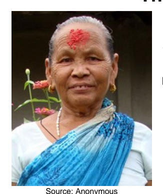
Population: 530,000 World Popl: 2,489,000