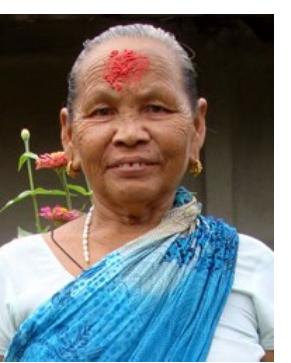
Population: 530,000 World Popl: 2,489,000