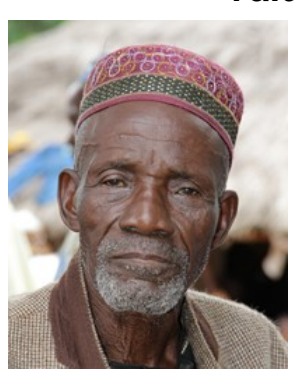
Population: 136,000 World Popl: 224,000 Total Countries: 4 People Cluster: Susu Main Language: Yalunka Main Religion: Islam