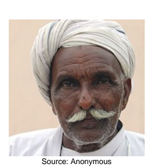
Population: 148,000 World Popl: 8,855,000