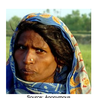
Population: 1,900 World Popl: 2,780,900 Total Countries: 2

People Cluster: South Asia Hindu - other