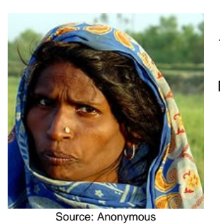
Population: 1,900 World Popl: 2,780,900 Total Countries: 2

People Cluster: South Asia Hindu - other