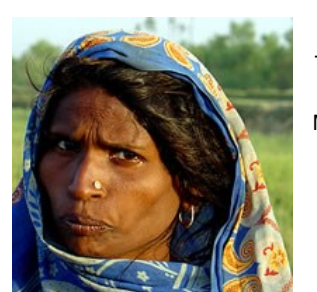
Total Countries: 2 People Cluster: South Asia Hindu - other