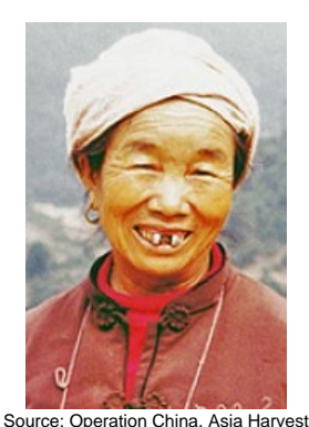
Population: 7,800 World Popl: 15,700 Total Countries: 3

People Cluster: Tibeto-Burman, other Main Language: Nisu, Southern Main Religion: Ethnic Religions