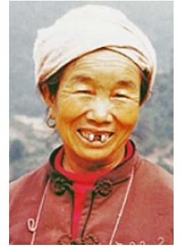
Population: 7,800 World Popl: 15,700 Total Countries: 3

People Cluster: Tibeto-Burman, other Main Language: Nisu, Southern Main Religion: Ethnic Religions