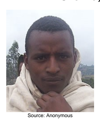
Population: 2,099,000 World Popl: 2,099,000 Total Countries: 1