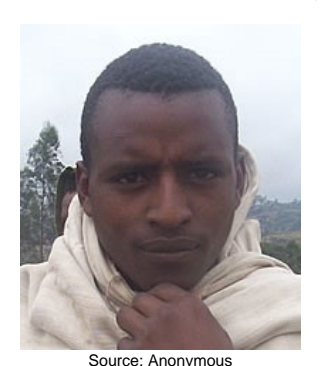
Population: 2,099,000 World Popl: 2,099,000

Total Countries: 1 People Cluster: Oromo