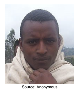
Population: 2,099,000 World Popl: 2,099,000 Total Countries: 1