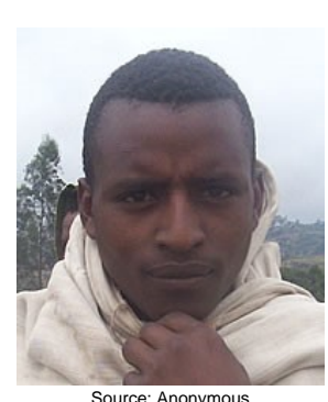
Population: 2,099,000 World Popl: 2,099,000

Total Countries: 1 People Cluster: Oromo