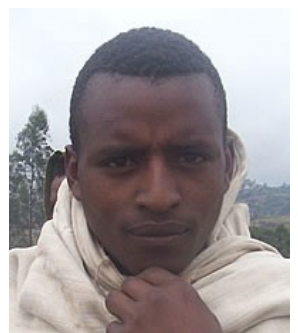
Population: 2,099,000 World Popl: 2,099,000

Total Countries: 1 People Cluster: Oromo