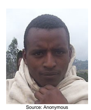
Population: 2,099,000 World Popl: 2,099,000

Total Countries: 1 People Cluster: Oromo