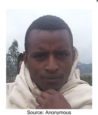
Population: 2,099,000 World Popl: 2,099,000 Total Countries: 1